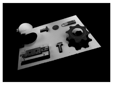
Considerably reflective / dark workpieces