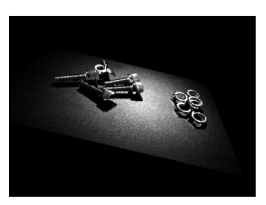
Screws & Nuts